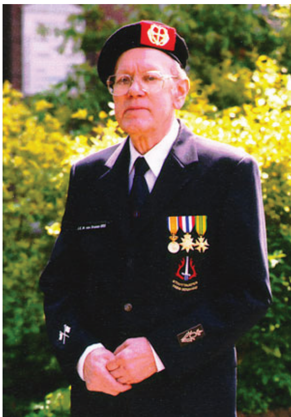
Certified radio-telegrapher SOWP since 1950